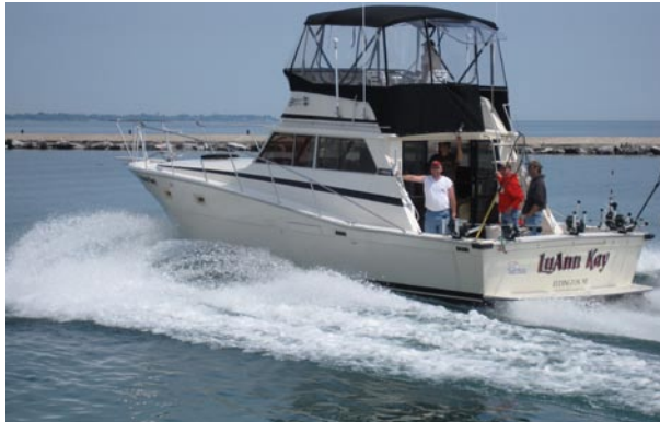
Viking 40' Convertible named LuAnn Kay

Our mission is to surpass your expectations and provide you with an exceptional fishing adventure on Lake Michigan. Albatross Fishing Charters offers first-class, fully insured Viking yachts equipped with high quality fishing tackle and leading-edge marine electronics. Our captains are expert fishermen, USCG licensed, with years of boating and fishing experience. Their knowledge of currents and the terrain of Lake Michigan waters, coupled with the high-tech equipment on board, insure you of a successful catch. Let us assist you in planning the outing you desire. We are the perfect choice for the serious angler or anyone seeking a fun outing for friends, family, co-workers or clients.