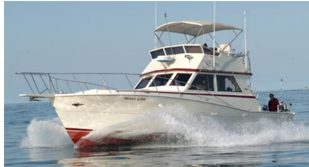
Viking 41' Convertible named Nicole Lynn

The pride of our fleet, a Viking 41' Convertible yacht, named Nicole Lynn , has state-of-the-art Furuno electronic fish finder, GPS, chart plotter, radar and 17" color monitor. She is fully equipped with safety equipment, Shimano fishing tackle and Big Jon electric downriggers. Accommodations include luxurious interior with heating/AC, private head, and an expansive flybridge.